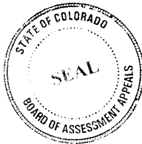
Toni Rigirozzi Toni Rigirozzi