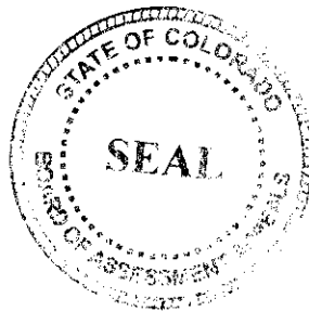
Toni Rigirozzi Toni Rigirozzi