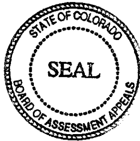
Toni Rigirozzi Toni Rigirozzi