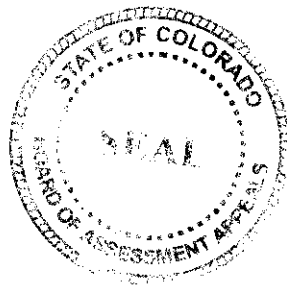
Toni Rigirozzi Toni Rigirozzi