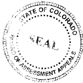
Toni Rigirozzi Toni Rigirozzi