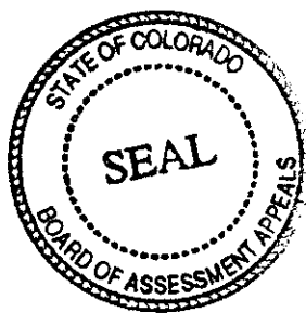
Toni Rigirozzi Toni Rigirozzi